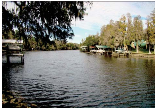
Figure 3. View of Alafia River from Pseudemys concinna suwanniensis nesting site, Riverview, Hillsborough County, Florida on 7 January 2014.