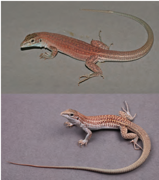
Figure 1. Upper. Adult holotype of A. neavesi (MCZ R-192219 [= SIMR 8093]) in life, January 11, 2011, SVL = 77 mm. Lower. Adult A. exsanguis (SIMR 13209) of Alamogordo, Otero County, New Mexico, stock, SVL = 76 mm.

with pale dots and spots on body; maximum snout-vent length (SVL) about 80 mm; tetraploid number of chromosomes about 91, with 4 haploid sets of the sexlineata species group, including the slightly modified triploid karyotype of some A. exsanguis from Alamogordo (Lutes et al. , 2011), and the 3 largest chromosomes being metacentric.