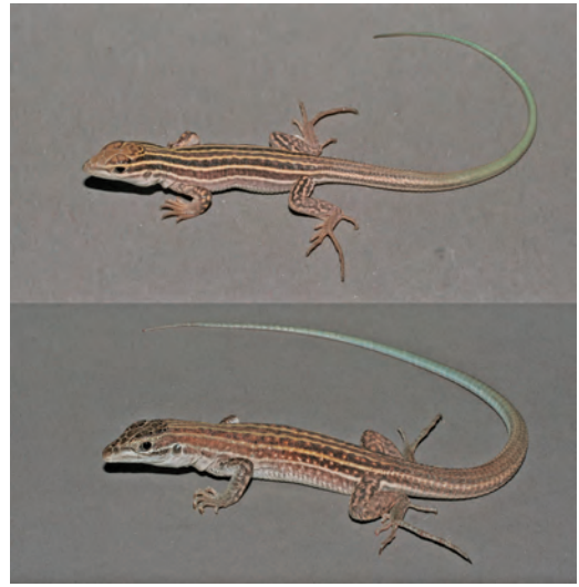
Figure 2. Ontogenetic changes in colors and pattern for two young individuals of A. neavesi for comparison with Fig. 1, upper. Upper. MCZ R-192243 (= SIMR 10400), SVL = 36 mm. Lower. SIMR 9575, SVL = 62 mm. Both photographed on January 11, 2011.

Description of Holotype. Paired data presented in the form x-y are for scale counts on the left-right sides of the body. SVL, 78 mm; rostral large, visible from above, wider than high; nostril low, posterior to center of nasal; nasals with a long median suture behind the rostral; frontonasal hexagonal; pair of irregularly hexagonal prefrontals with a long median suture; frontal hexagonal, longer than wide, wider anteriorly than posteriorly; pair of irregularly pentagonal frontoparietals with a long median suture; 3 irregular-sized and irregular-shaped parietals in a transverse