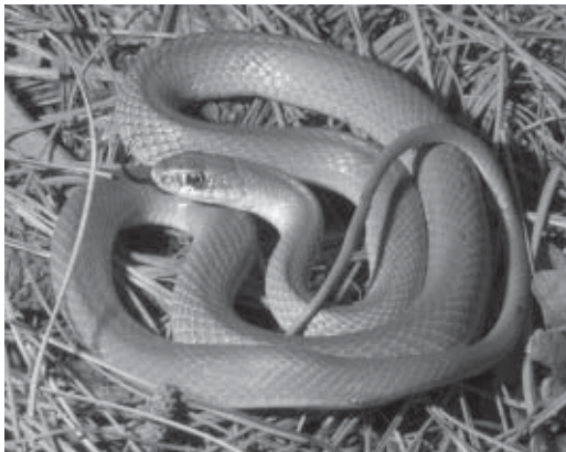
Six Eastern Racers were found during the 2005 KHS spring field trip to Shawnee County State Lake.