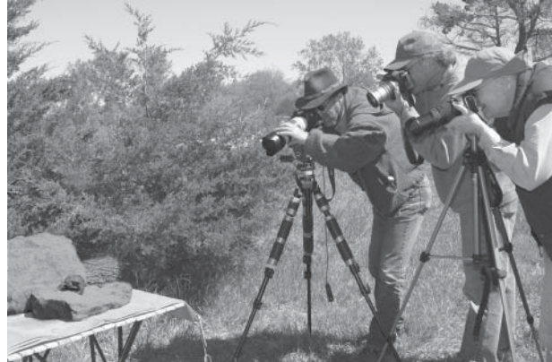
Three wildlife photographers from Topeka spend some time photographing an adult male Ornate Box Turtle and several other species during the spring field trip.