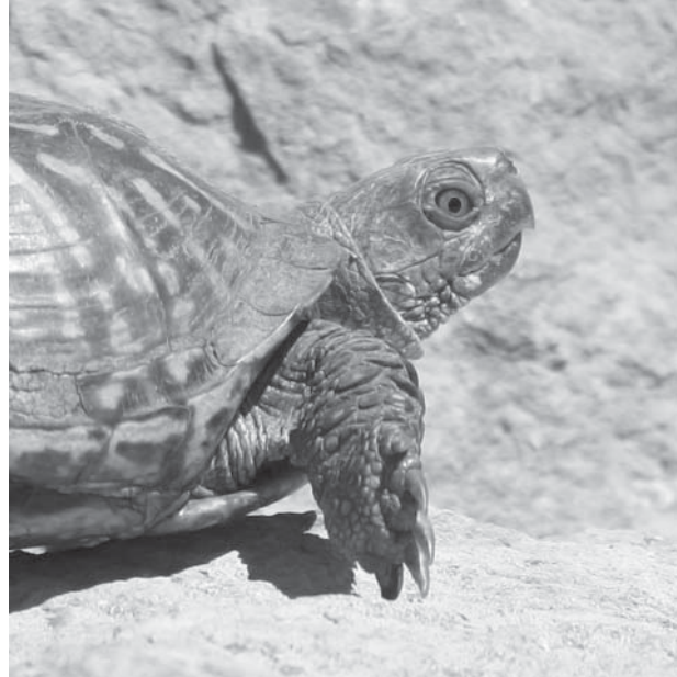
An Ornate Box Turtle, our state symbol, steps lively for the camera. Many of these gentle creatures were observed during the KHS spring field trip to Shawnee County State Lake.