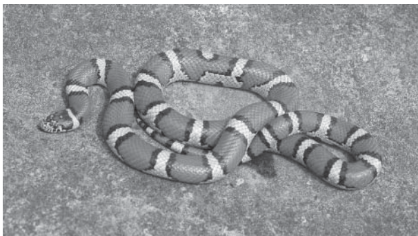
Milk Snakes were discovered during the 2005 KHS spring field trip to Shawnee County State Lake. These colorful reptiles are a favorite with photographers.