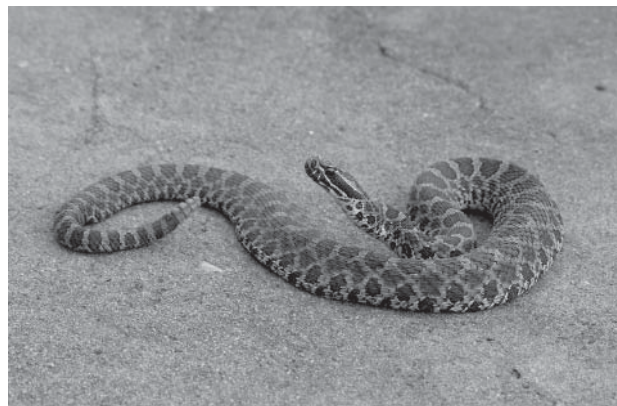
An adult Massasauga absorbs heat from a concrete slab during the 2005 spring field trip of the Kansas Herpetological Society that was headquartered at Shawnee County State Fishing Lake. This snake is quite common around the lake, but due to cool temperatures only three were discovered during the event.