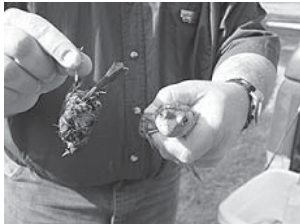
A Bullfrog and the Common Yellowthroat that it tried to eat while the bird was entangled in a mist net in Meade County, Kansas.